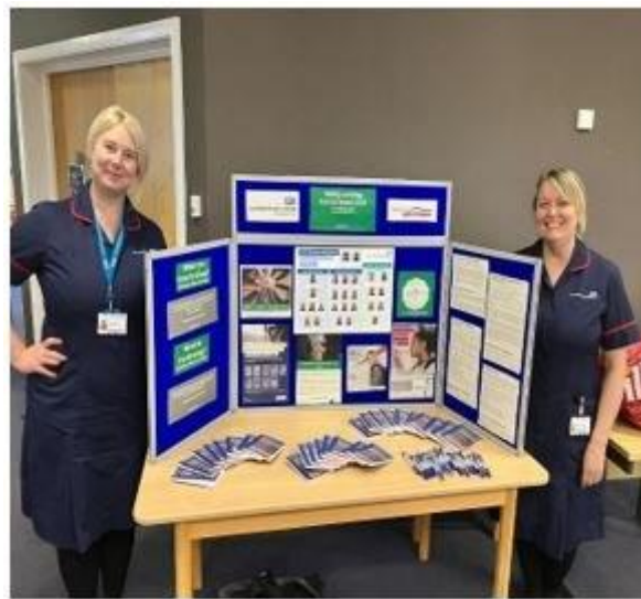
2 - STSFT's Domestic Abuse stall